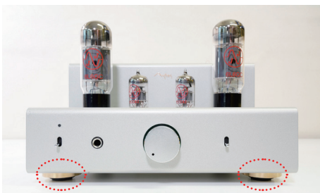
TU8200R (with spacer)